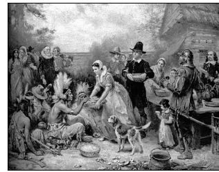
"The First Thanksgiving" Jean Leon Gerome Ferris, American Painter 1863 - 1930