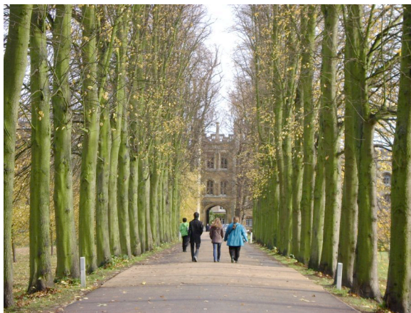
Not far from Hogwarts. Cambridge, England MHSA Theatre Trip to the UK 2008